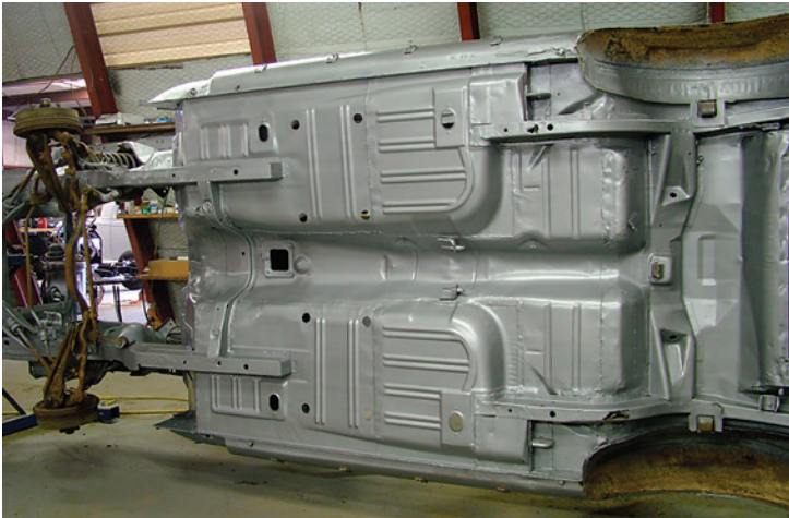
After Rust Bullet application. The coating requires no preparation other than the removal of large flakes of loose rust by light scraping or brushing.

an extended curing time and multiple-step process for remedy. Breaches in an epoxy coating are labor intensive and involve a large area outside the breach to be included in the repair. The Rust Bullet coating rarely experiences a breach but, when it does occur, the breach is easily repaired with simple scuffing and application of additional product.