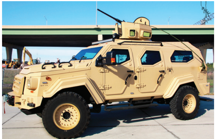
If a color other than metallic gray is desired, a topcoat may be applied within 24 to 48 hours after the final Rust Bullet coat.