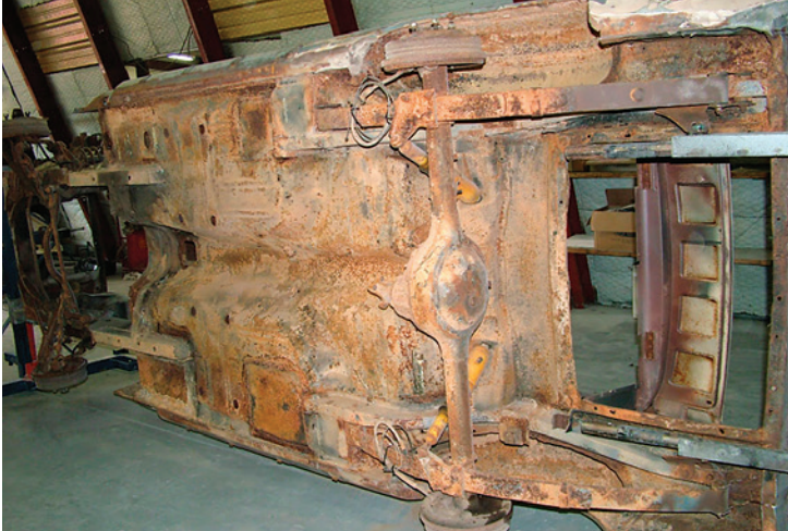
Significant corrosion on the underside of a Mustang.