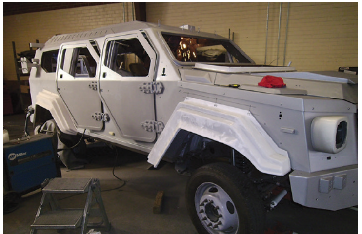
Rust Bullet applied to a military vehicle.

The Rust Bullet coating features a unique, “self-inspecting” property in that it fails almost immediately if it is incorrectly applied or if there is a problem with the surface preparation. Thus, polyurethane coatings can be inspected immediately after application and any defects will be visible and can be remedied quickly. This is not the case with an epoxy coating that requires